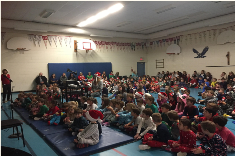
Picture from our December sing-a-long